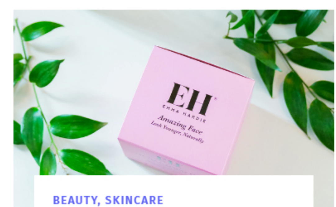
BEAUTY, SKINCARE Emma Hardie Limited Edition Moringa Cleansing Balm