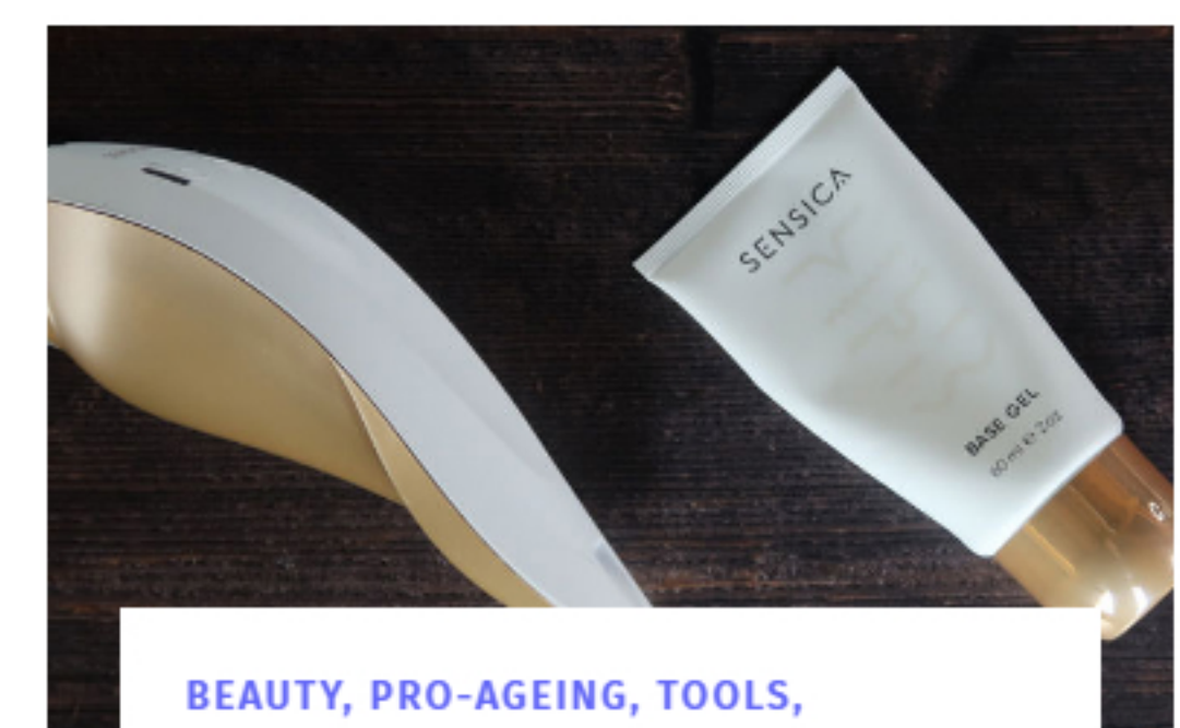
BEAUTY, PRO-AGEING, TOOLS, TREATMENTS Sensica Sensilift Skin Tightening System