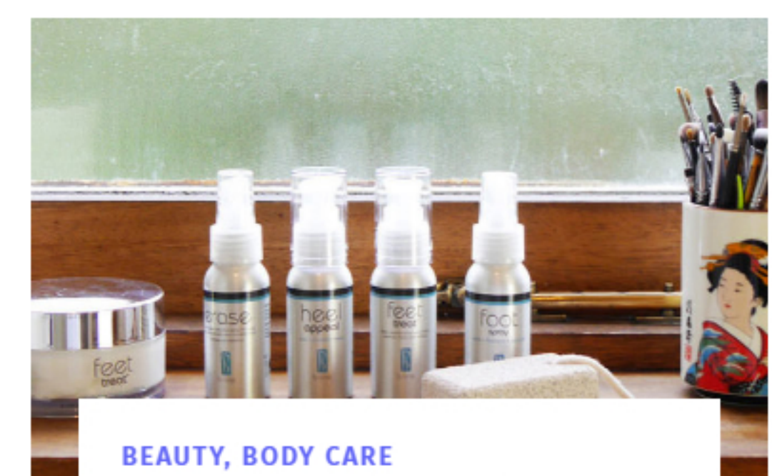
BEAUTY, BODY CARE B-Line Beauty – footcare for a salon-quality home pedicure